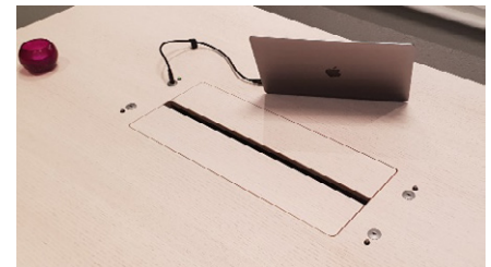
Retrofit solution in existing conference table